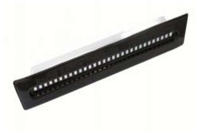
Figure 3. Small hive beetle frame trap

Both traps are commercially available from most good beekeeping equipment suppliers.