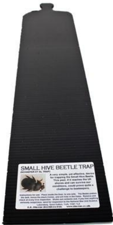
Figure 2. Small hive beetle floor trap